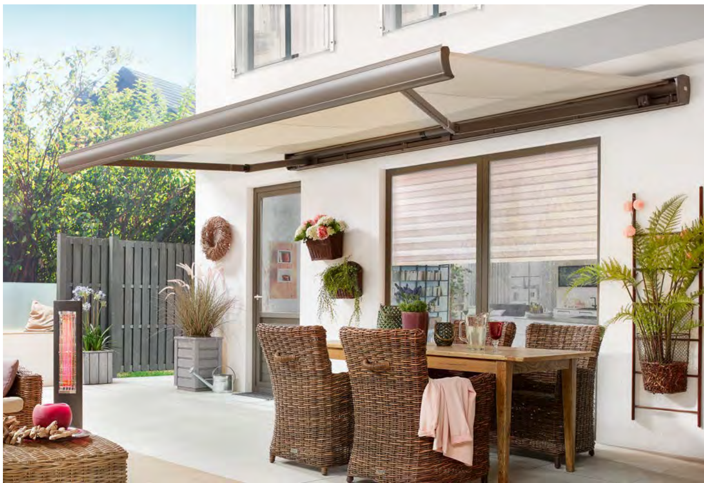
Compact design with a high degree of comfort and superb technical features.

Classic design, superior quality, ease of operation and high value retention: the Family Compact combines the protective function of a cassette awning with the ease of installation of a back bar awning.